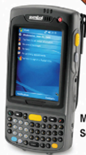
Motorola MC7090 Scans 1D barcodes