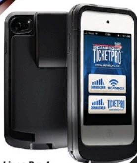
Linea Pro 4 for iPod & iPhone Scans 1D and 2D (QR) barcodes