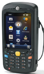
Motorola MC55A0 Scans 1D and 2D (QR) barcodes