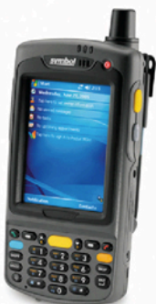
Motorola MC7094 Scans 1D and 2D (QR) barcodes